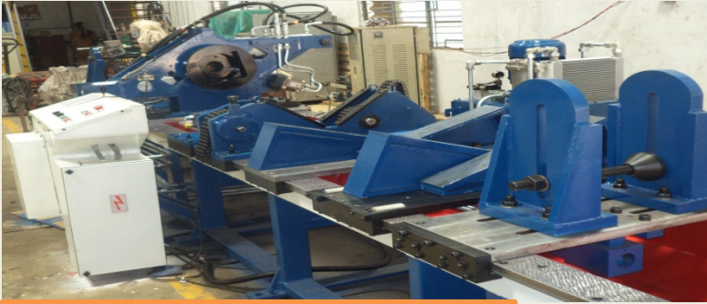
HYDRAULIC CYLINDER REPAIR BENCH